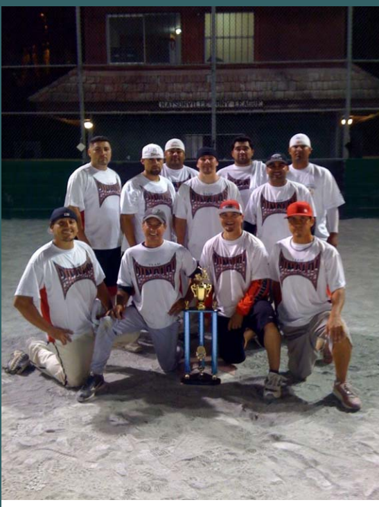
TEAM RINALDI "OPEN" CHAMPS