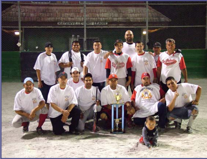
LA PLEBADA D5 CHAMPS