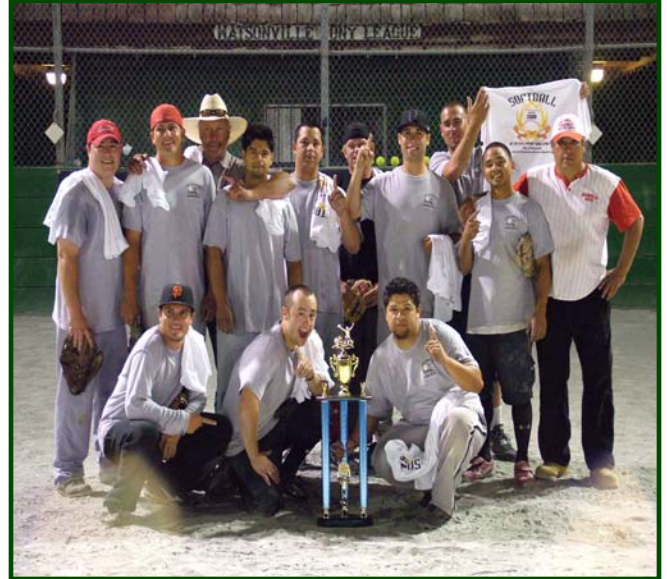
LAS ANIMAS CONCRETE D4 CHAMPS